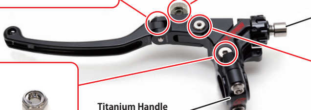
Titanium Wire Adjuster Not for Individual Sale