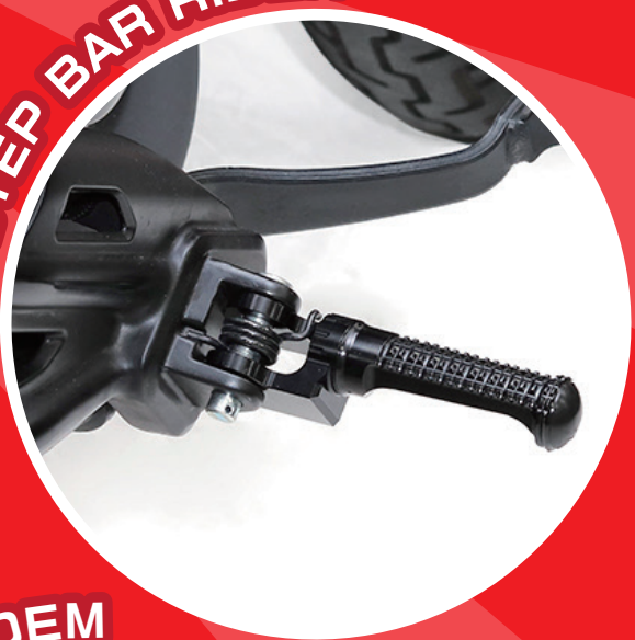
STEP BAR RIDER