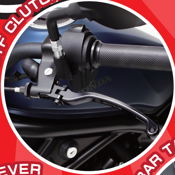
STF CLUTCH LEVER