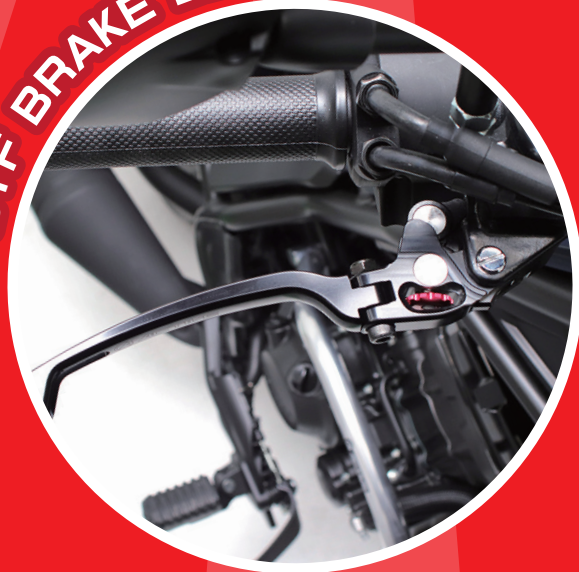
STF BRAKE LEVER